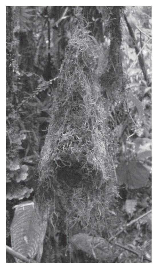
Figure 2 (left). Nest of Streak-necked Flycatcher Mionectes striaticollis at Yanayacu Biological Station, Napo province, Ecuador

All nests were located within 5 m of streams and five were suspended directly over water. Nests were found along small, 1–3 m-wide streams, as well as larger, 10–40 m-wide rivers. All but one were located inside relatively intact, moss- and epiphyte-laden forest with canopy height of 15–25 m and characterised by a relatively dense understorey of Cyathea spp. (Cyatheaceae) tree ferns, other fern genera, various Rubiaceae and Solanaceae saplings, and a variety of herbaceous Piperaceae, Gesneriaceae and Urticaceae. A single nest was found in highly disturbed forest, lacking canopy cover, but covered by a dense stand of bamboo ( Chusquea sp.) averaging 3 m in height. No