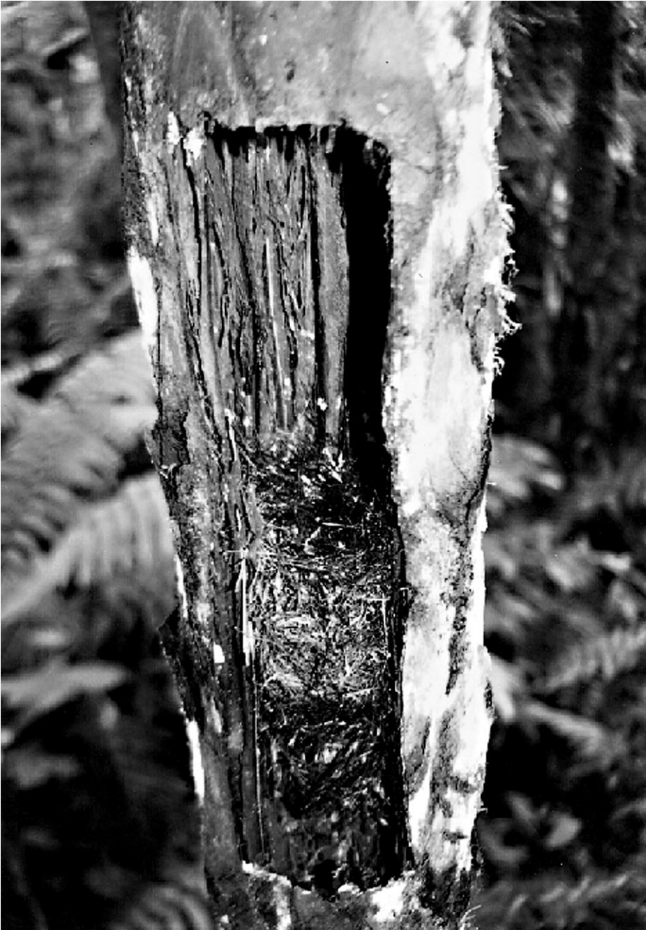
FIG. 1. Rusty-winged Barbtail nest inside hollow tree-fern snag, with section of bark cut away to show nest structure. Photograph by B. Swift, Napo Province, Ecuador, 14 March 2002.

30% on 2 March, 8% on 4 March, 5% on 6 March, 4% on 8 March, 2% on 10 March, and 3% on 12 March. Mean time spent in the nest cavity per visit declined from 3.3 min on 2